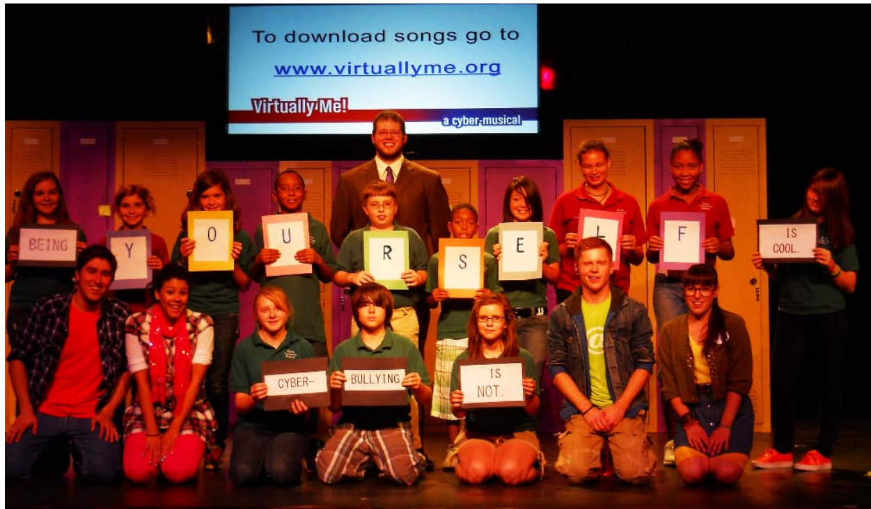
First Lutheran School in St. Petersburg, FL